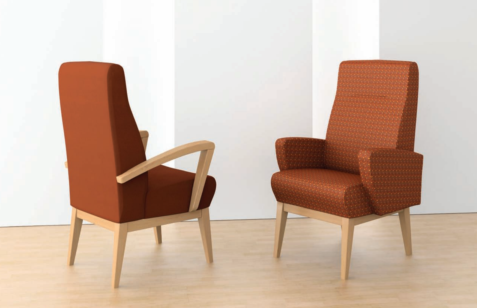
Rio Pull Up High Back shown with Boomerang Arm and Standard Arm.