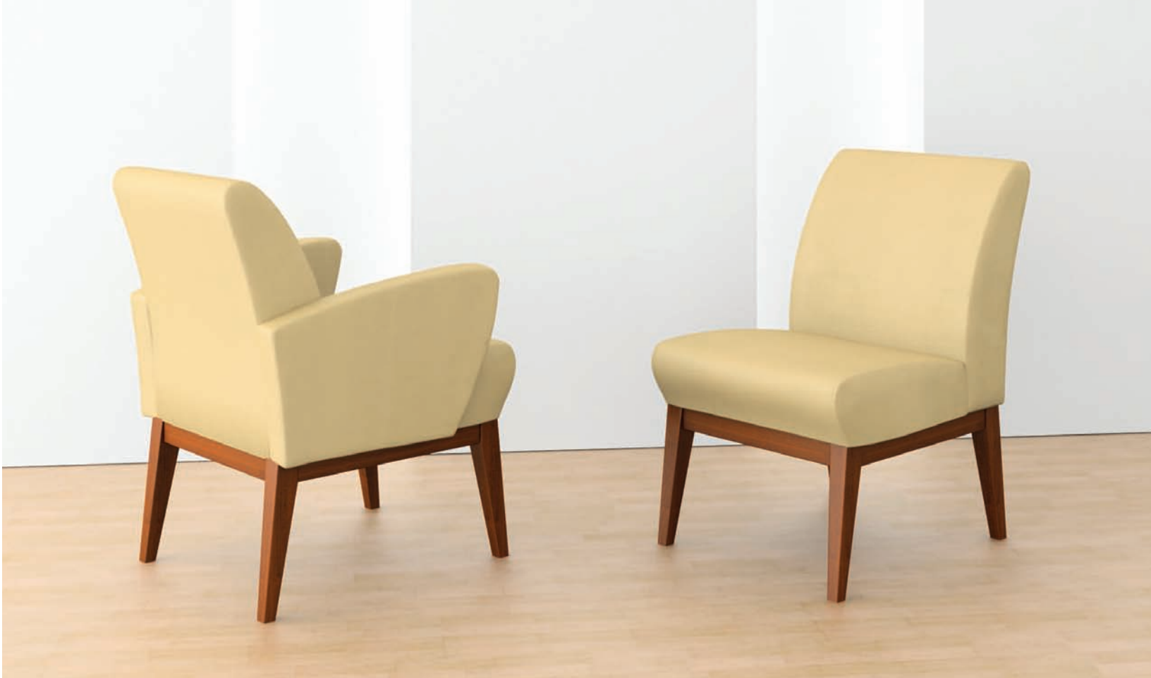
Rio Pull Up with Upholstered Arms and Armless, above. Rio Pull Up with Boomerang Arms, left.