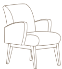
Pull Up Chair