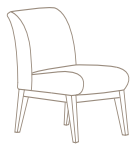
Pull Up Chair, Armless