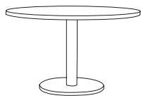
Large Disk Base

Celebrated for its design. Chosen for its quality. AGATI.