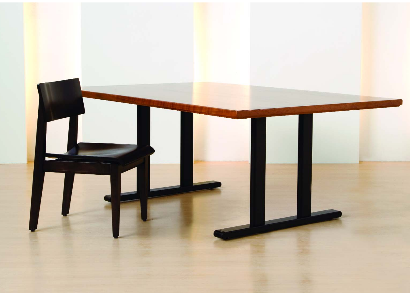
Trestle Base table shown in black powdercoat finish with solid cherry top. Baja Chair in Espresso finish.