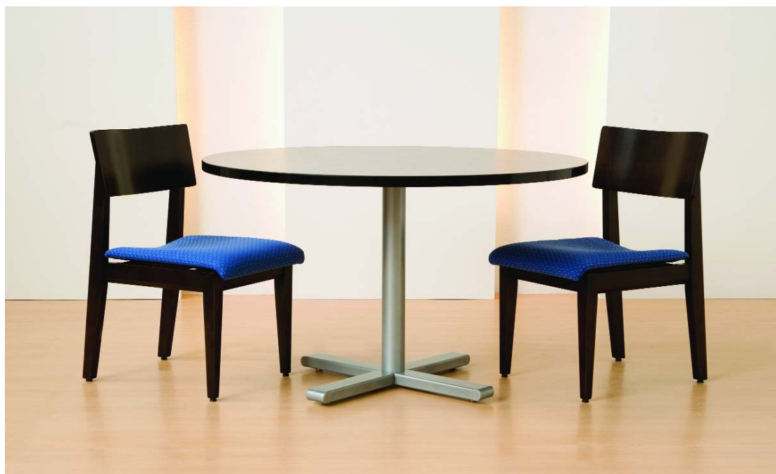
Top: Large Disk Base shown in chrome with black laminate top with inset marmoleum. Baja Chair in Espresso with upholstered seat.