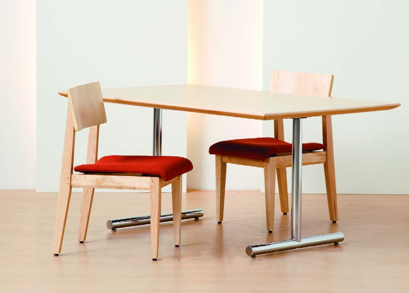
T-Base table shown in chrome with maple top with inset marmoleum. Baja Chair in Maple with upholstered seat.