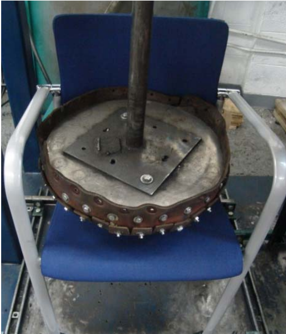
Seating Impact Test