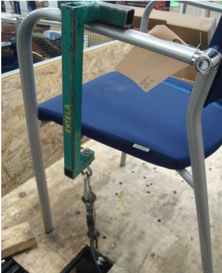
Arm Strength Test Vertical-Static