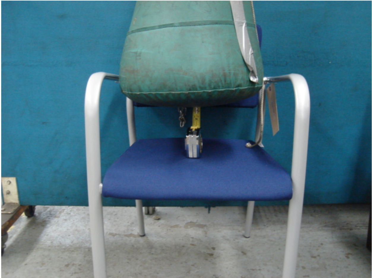
Drop Test - Dynamic