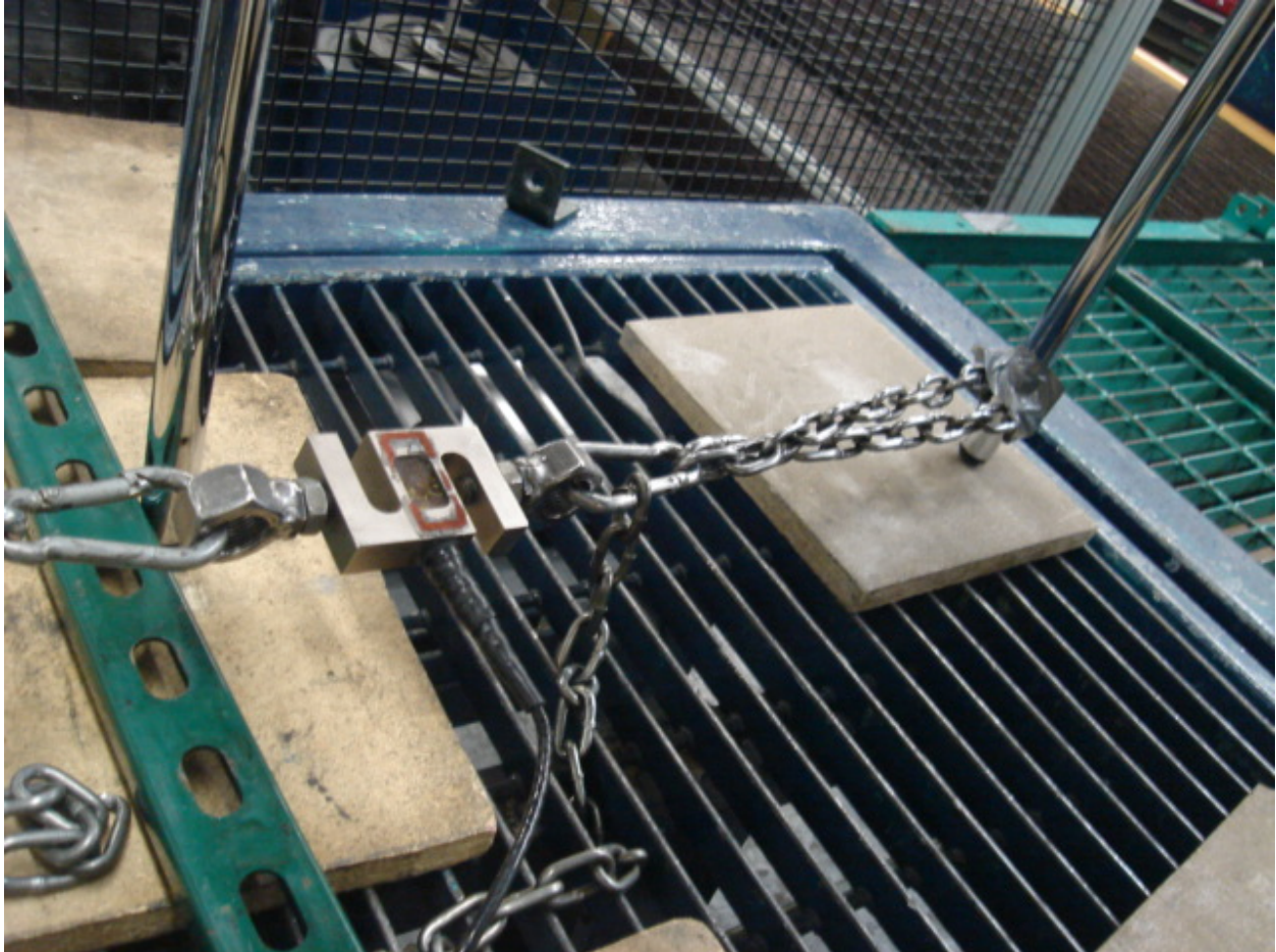
Leg Strength Test - Setup