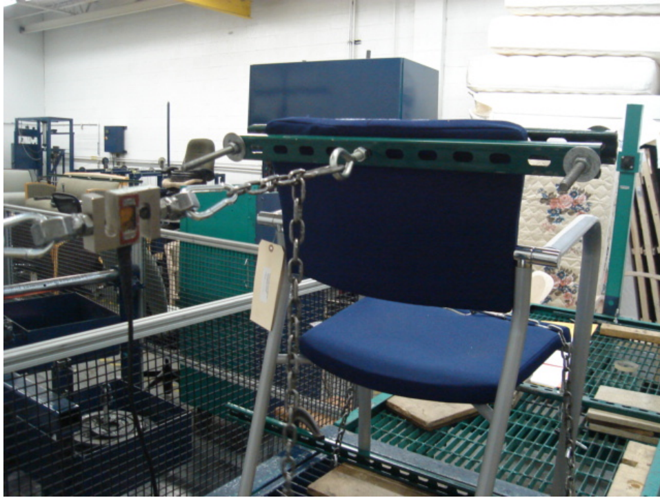
Back Strength Test- Static