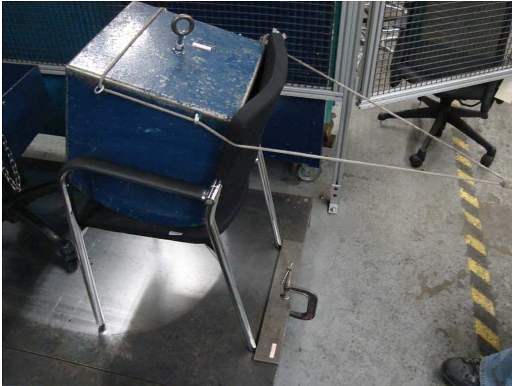
Stability Test -Dynamic (Rear)