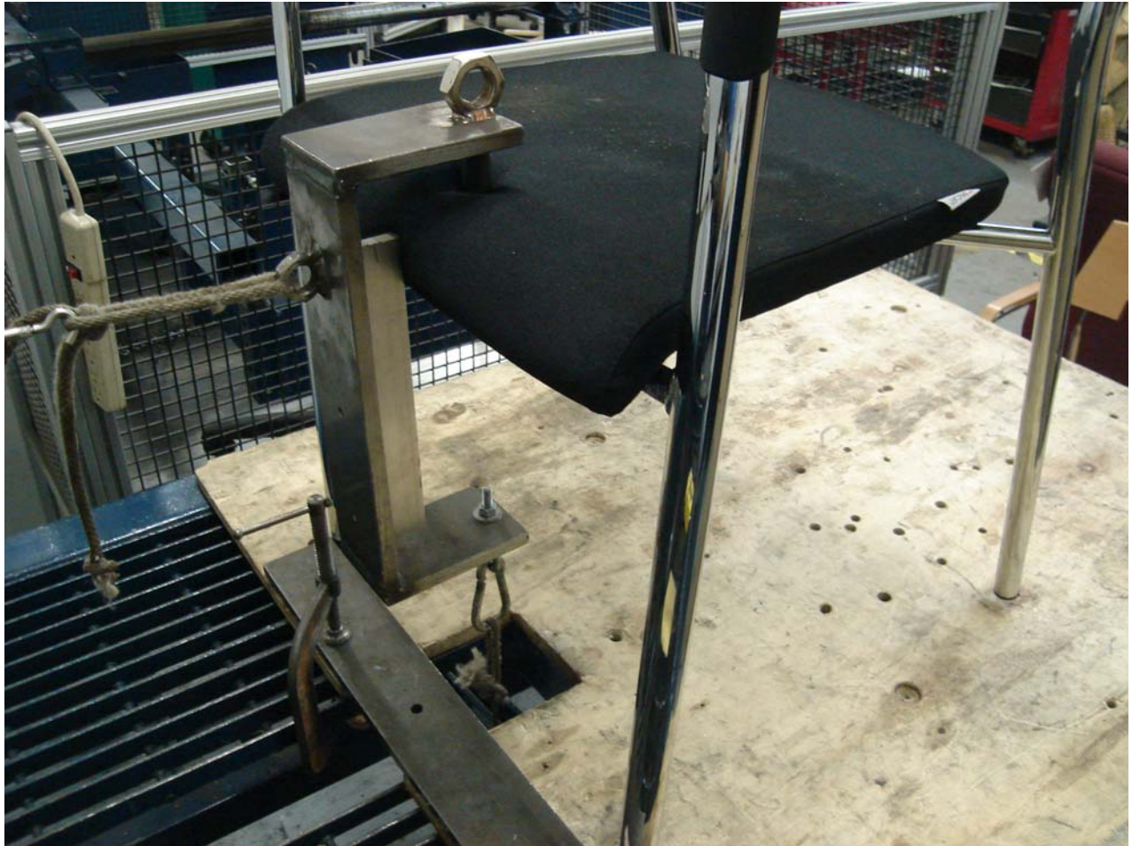
Stability Test -Dynamic (Front)