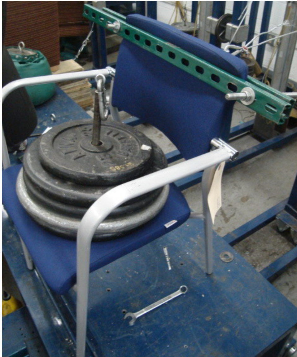
Back Durability Test-Cyclic