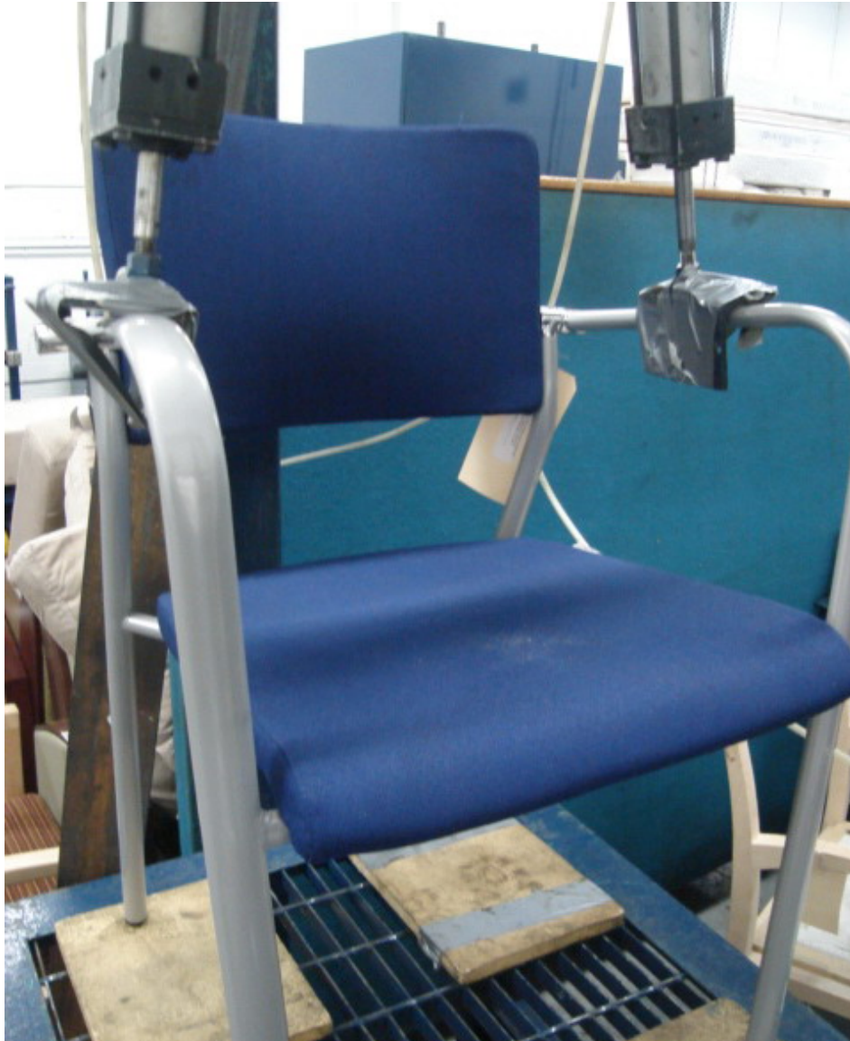
Arm Durability Test- Cyclic