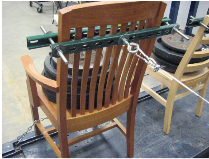
Back Durability Test-Cyclic