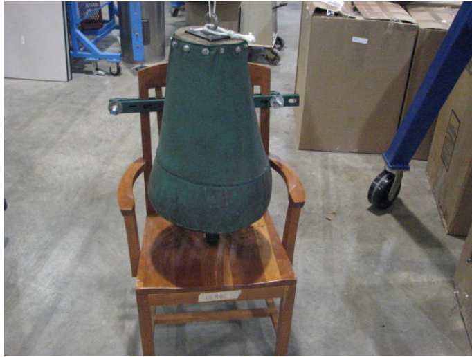
Drop Test - Dynamic