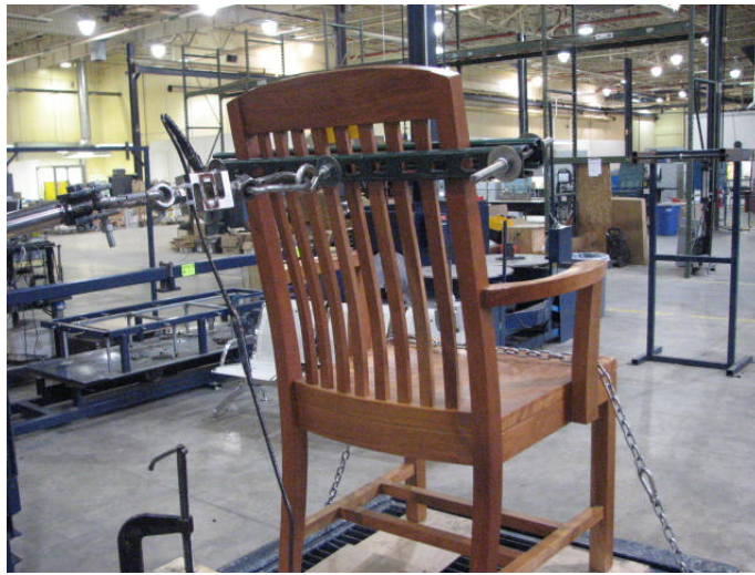
Back Strength Test