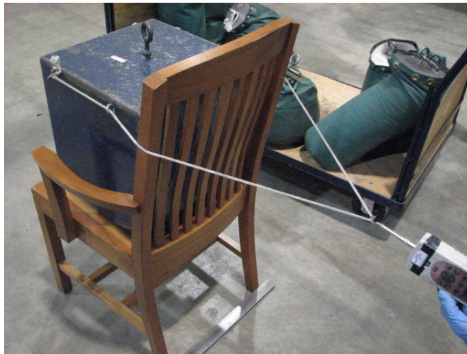
Stability Test -Dynamic (Rear)