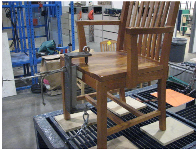
Stability Test -Dynamic (Front)