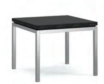
Roland Occasional Table with granite top.