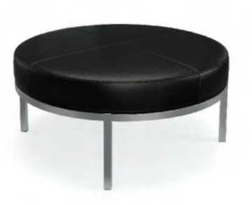
Roland Round Bench with upholstered seat.

Roland Study Table with cherry top and lighting option.