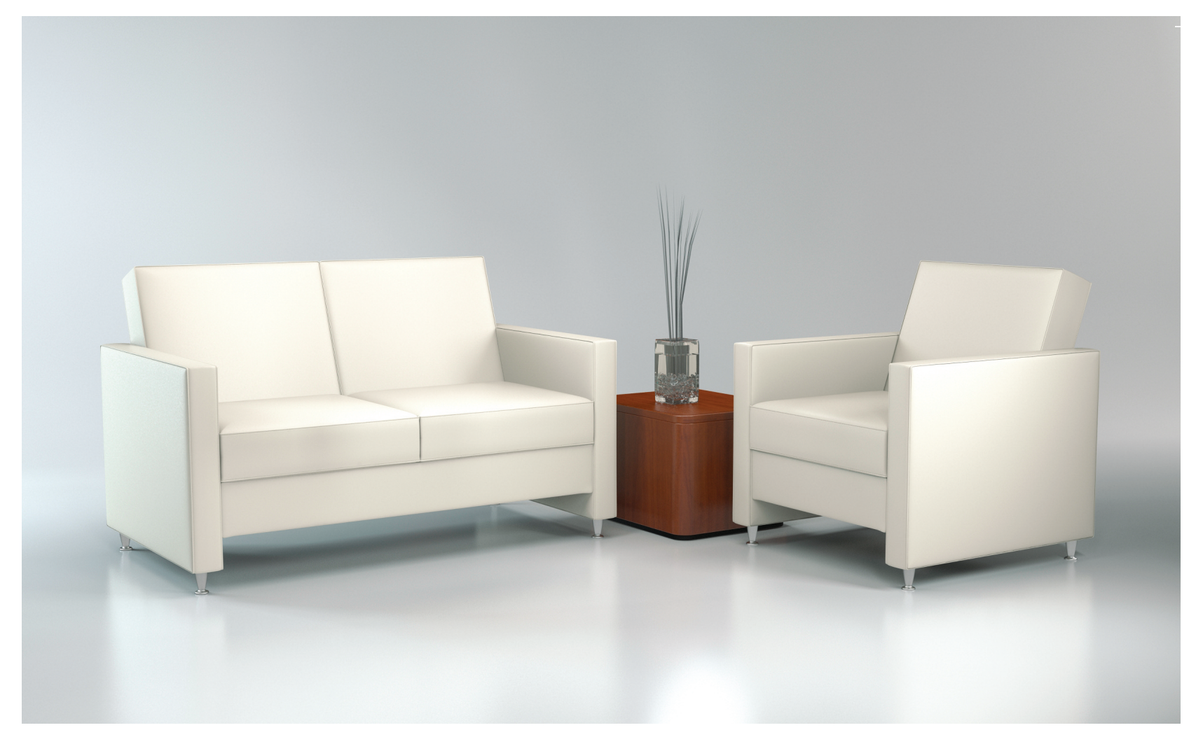
Tuxedo Settee and Lounge Chair.