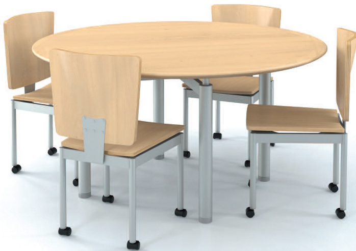
Antrim Table in maple, Antrim Chairs with casters.