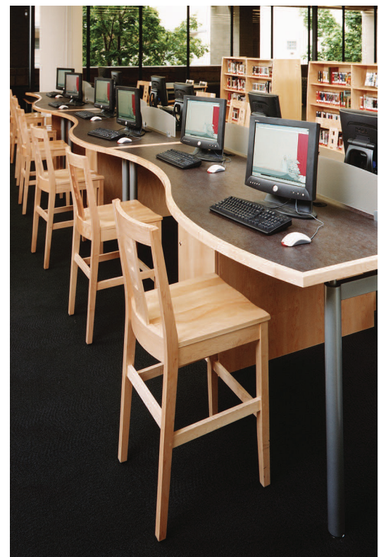
Oak Park Public Library, Open Book Cafe