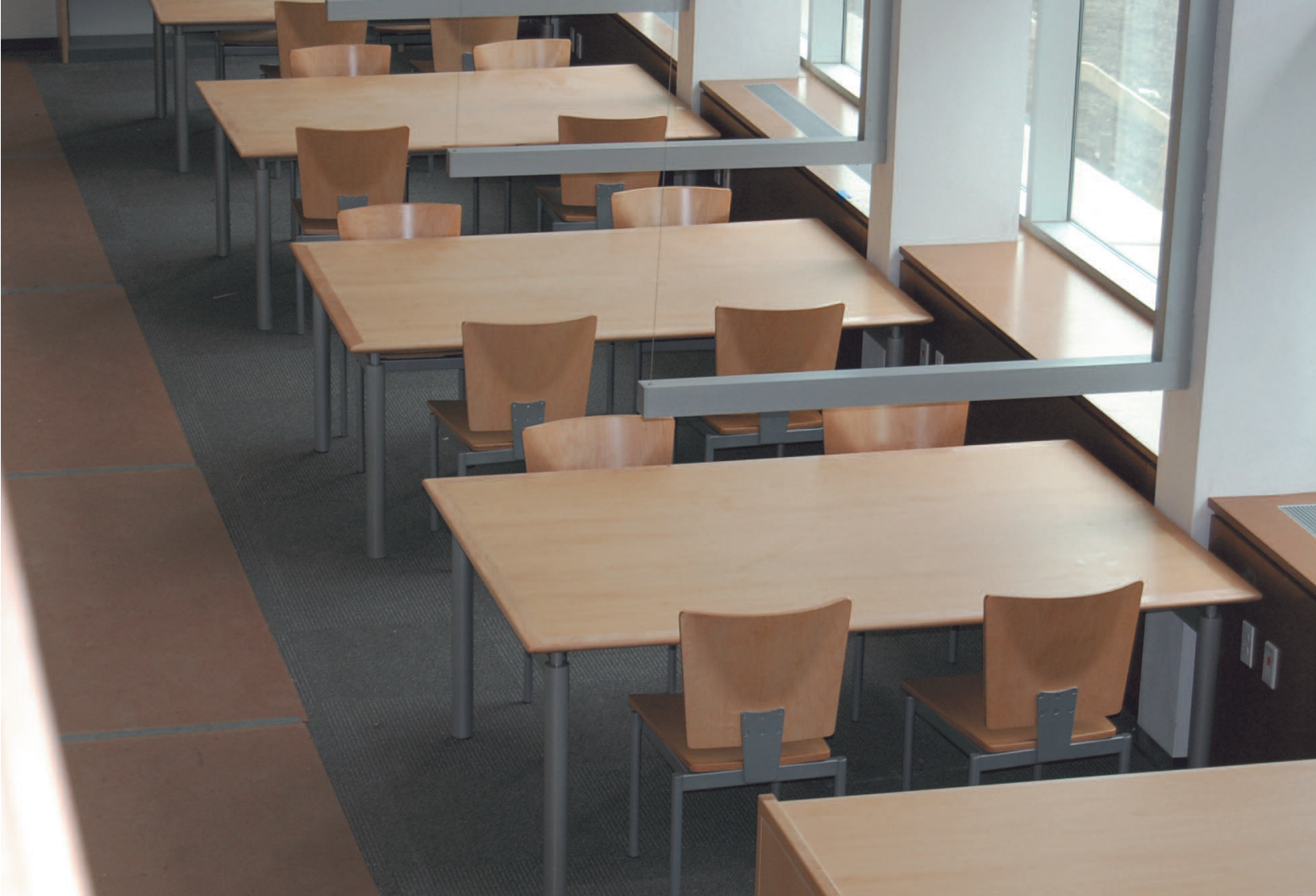
The City College of New York, Spitzer School of Architecture.