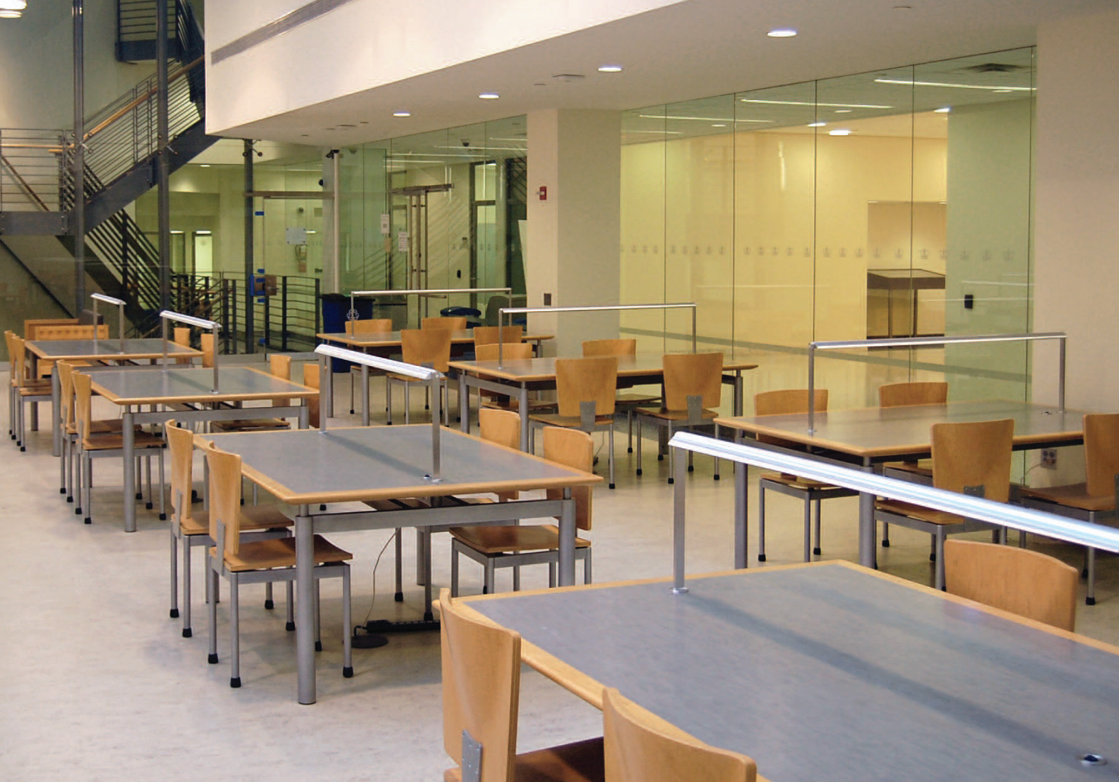
Columbia University Health Sciences Library, Hammer Teaching & Learning Center