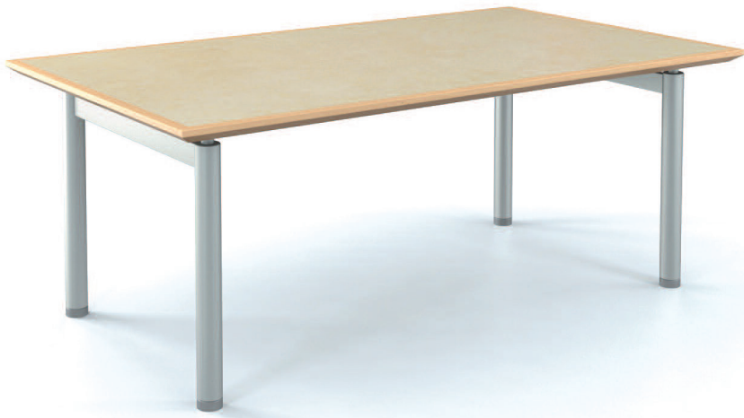
Antrim Table in maple with inset Marmoleum top and Stardust Silver finish.