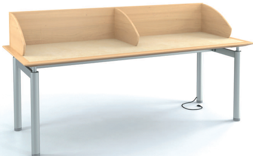
Antrim Carrel in maple with wire chase leg option, below left. Antrim Stacking Chairs, below right.