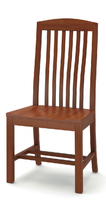
DePaul Armchair with upholstered seat and Side Chair.