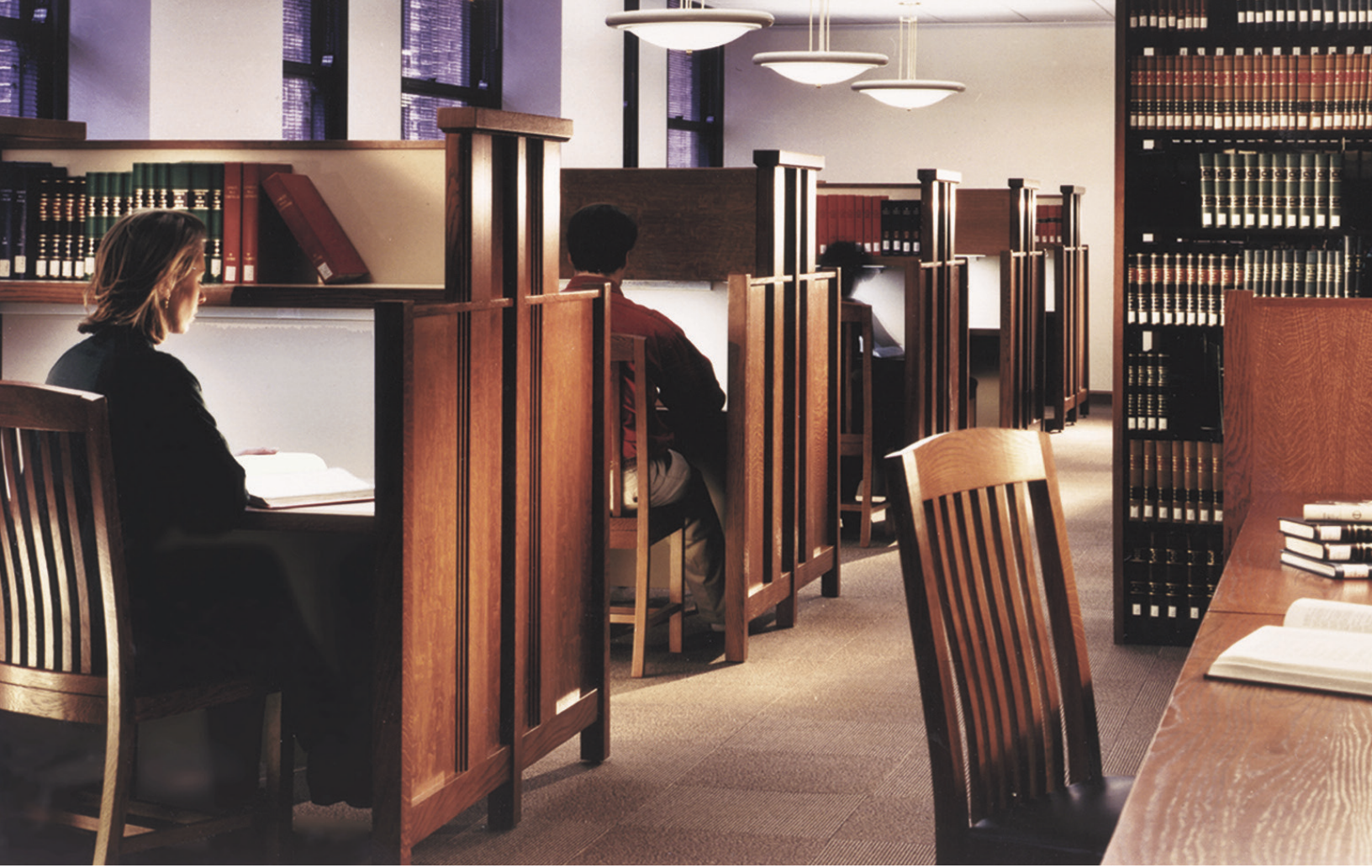
DePaul University Law Library, Chicago, IL