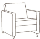
Lounge Chair Metal Feet