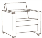
Lounge Chair with Tablet Arm Wood Feet