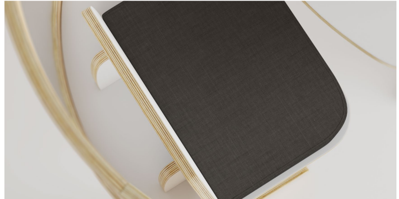
Reovable and replaceable seat cushion