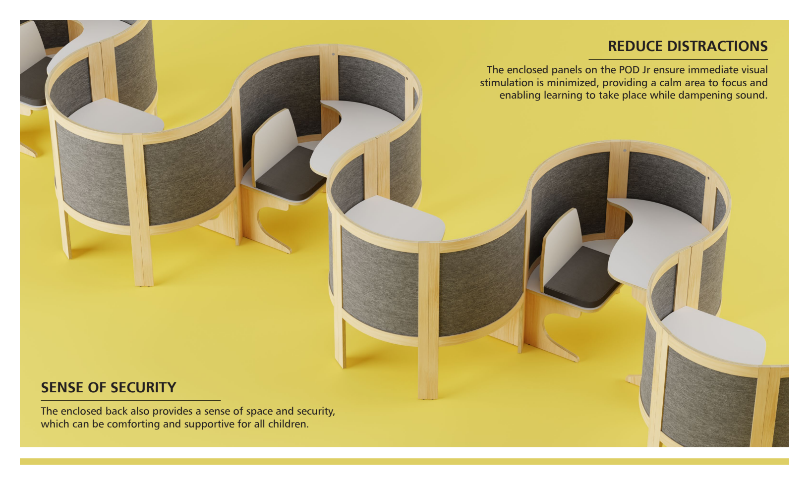
Cleanable acoustical paneling & acrylic